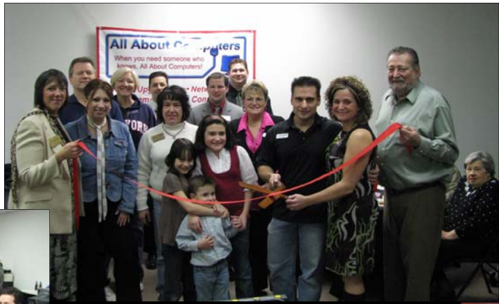
All About Computers Ribbon Cutting/Open House