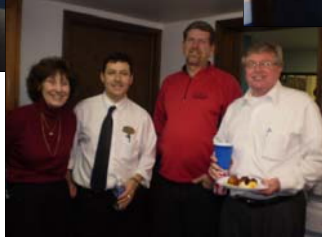
Porter's Restoration Business After Hours March 10, 2009