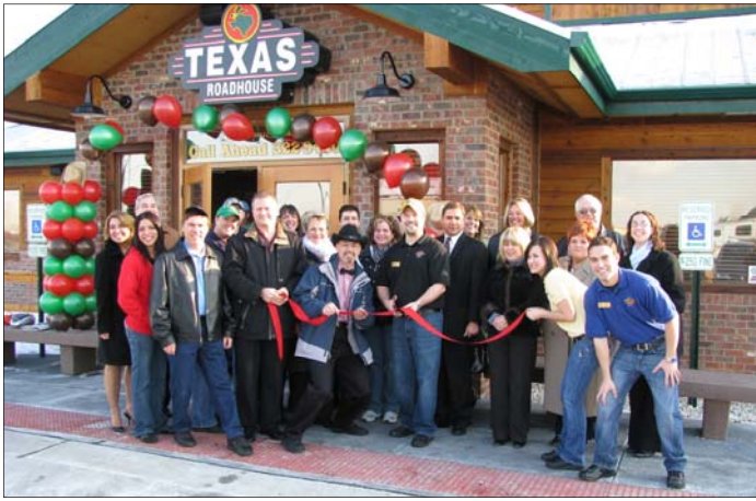
Texas Roadhouse Ribbon Cutting